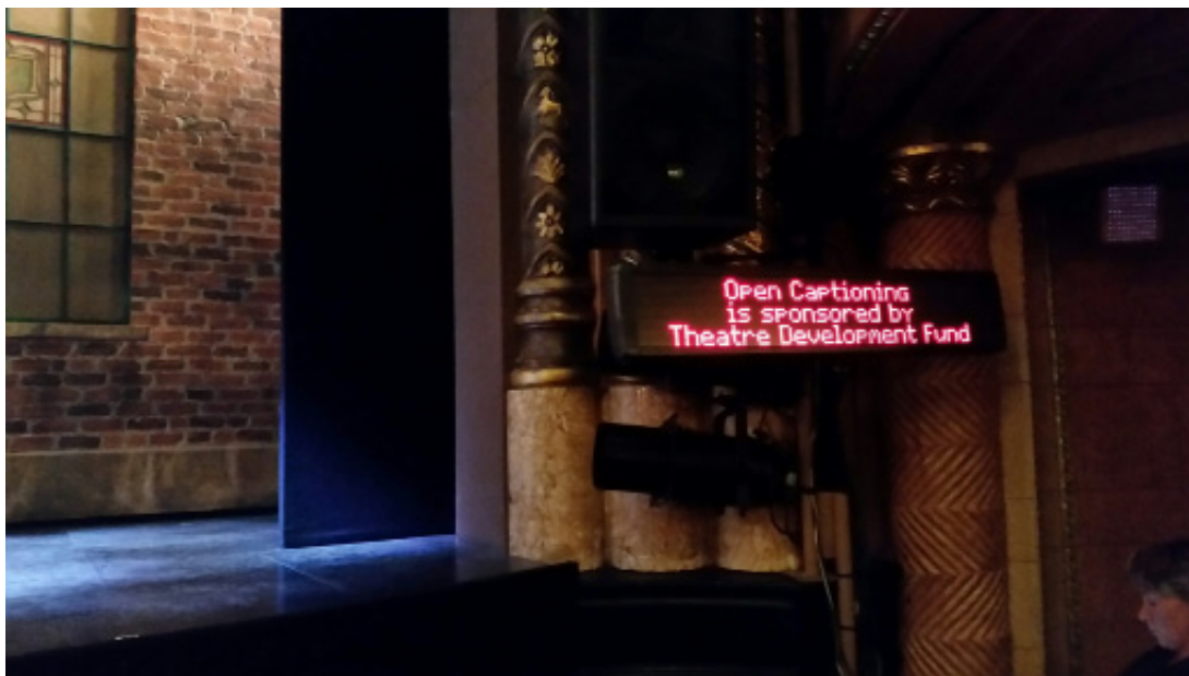
Example of LED Board being mounted near the speaker stack using a custom clamp